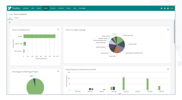
Custom reports help you make better decisions

Unlock the full potential of localization with advanced custom reporting capabilities and intuitive dashboards. Trados Enterprise gives you the flexibility to embed a wide range of system data into custom reports, delivering ultimate insight into linguistic data, performance metrics and projects. Maximize your ability to make informed, data-driven decisions and optimize your localization processes.