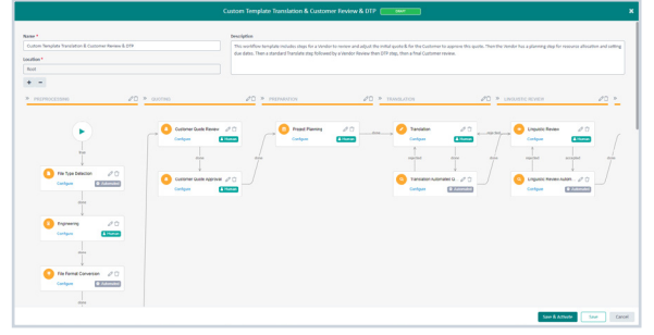
Amend any workflow in the workflow editor

Create your own workflow templates in our powerful workflow editor, completely customizing every step to your requirements. The visual interface lets you define your own routes for the flow of work – onwards, backwards, branching or in loops – for ultimate flexibility. You can streamline your processes and automate manual handoffs between all stakeholders, including requesters, project managers, linguists and reviewers. With end-to-end clarity and visibility, Trados Enterprise minimizes the chances of miscommunication and helps you optimize all your localization processes.